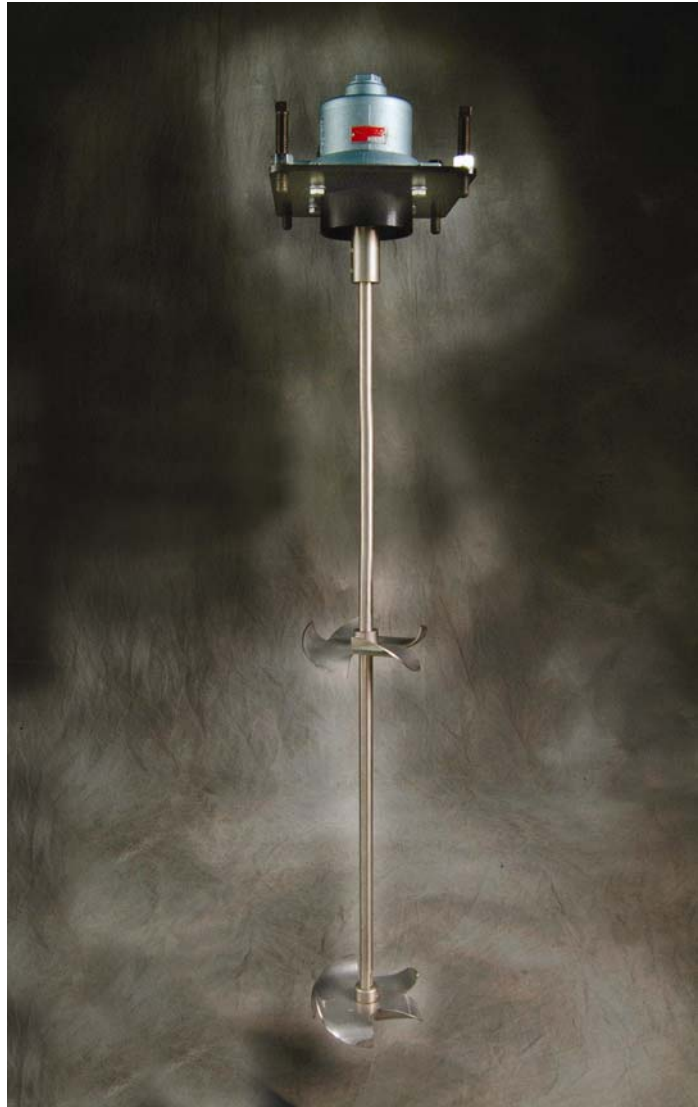
PLATE MOUNT SERIES MIXERS

Our products are guaranteed against defective materials and workmanship. We will repair or replace such items as may prove defective at our option. Warranty period is one year on items manufactured by FAWCETT. On items not manufactured by FAWCETT, the manufacturer's warranty applies. All component parts of our products are covered by this warranty, except for normal wear items such as impellers. We cannot be responsible for damage or abuse to equipment caused by improper installation or operation. Warranties can also be voided by unauthorized disassembly of equipment. For warranty repairs, equipment is returned to FAWCETT at the customer's expense; we will repair and return to customer at our expense. Under no circumstances will we allow labor charges or other expense to repair defective merchandise. This warranty is exclusive and is in lieu of all other warranties, whether express or implied. FAWCETT shall not be liable for any other damages, whether consequential, indirect, or incidental, arising from the sale or use of its products.